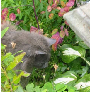
Looking for a mouse

On Waitangi Day, our cat Whiskers caught a mouse. Whiskers is over 15 years old now which is old for a cat. He was so proud that he brought it to the front door to show us. He tried to meow with a mouse in his mouth which was a very funny sound. I heard the funny sound and turned around. That's when I saw Whiskers coming inside the house with the mouse's tail hanging out of his mouth. I told him I had seen how clever he was, and go away now. But he kept trying to come inside the house.