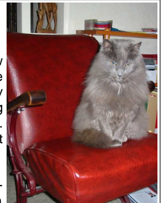
Whiskers being good

Animals are fun to have as part of the family. Be kind to your pets and other people's pets.