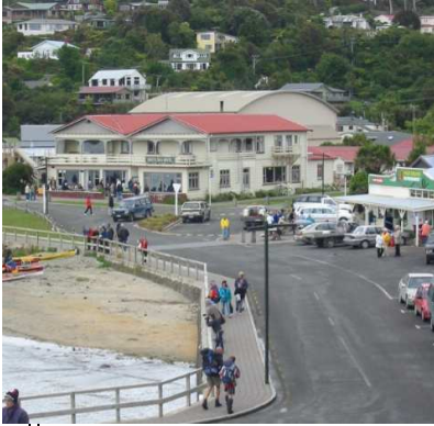
(above) Halfmoon Bay the day the cruise ship visited